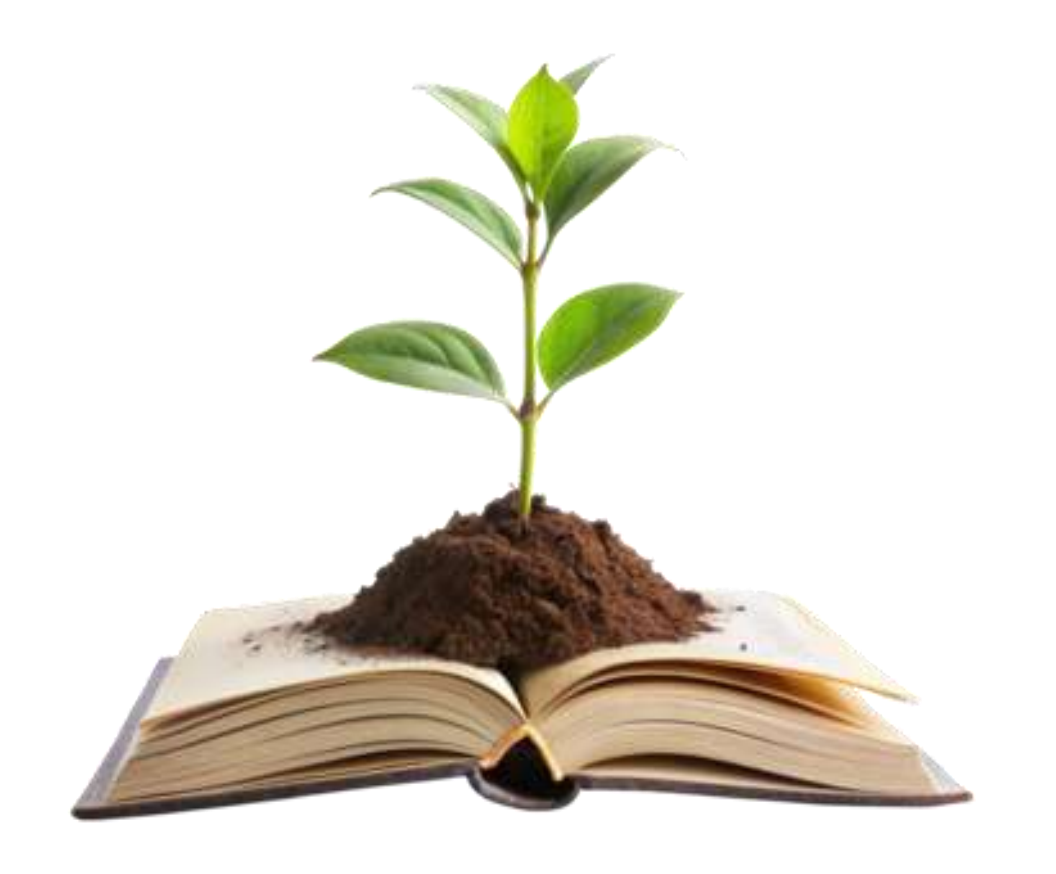
Are you a good learner?