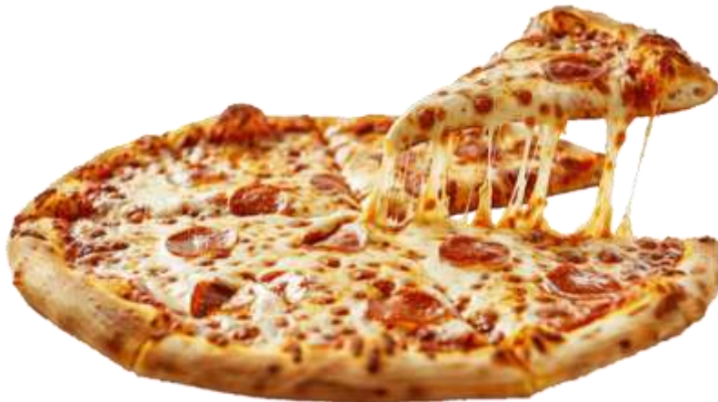
Pizza – Naples, Italy