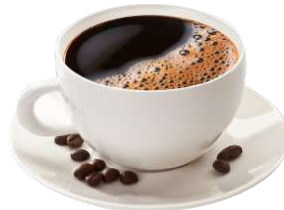
Coffee – Ethiopia