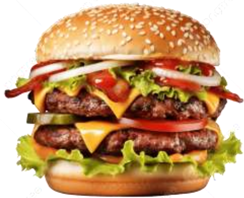
Burger – United States