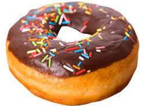
Donut – Netherlands