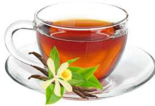
Tea – China